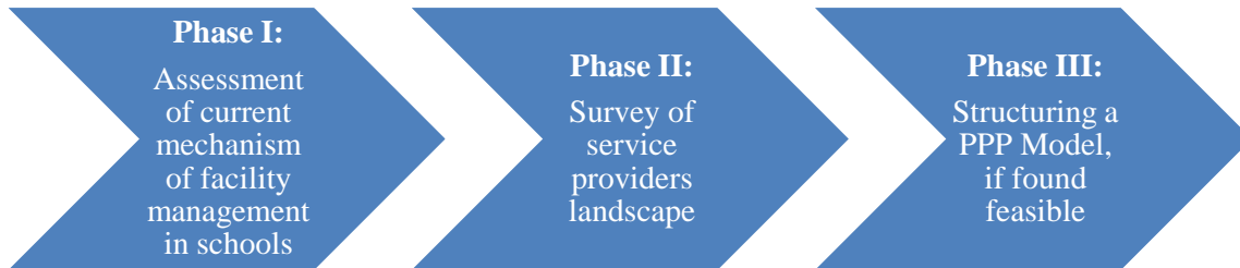
Figure 1: Approach and methodology used for the study

Phase I - Assessment of current mechanism of facility management in schools: This phase included conducting field surveys in selected Government schools in Karnataka to gauge the current availability of services and to understand how these services are currently managed. We also interacted with the Department of School Education to understand the overall picture for the Government schools in the State.