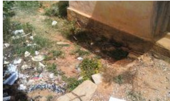
Note: Pictures taken in (1) Government Model Primary School, Hosahalli, Vijayanagr, Bangalore; (2)Government High School, Sarakki, J.P. Nagar, Bangalore; (3) Government Model Primary School, Byatarayanapura, Bangalore; (4) Government High School, B.B. Road, Chikballapur